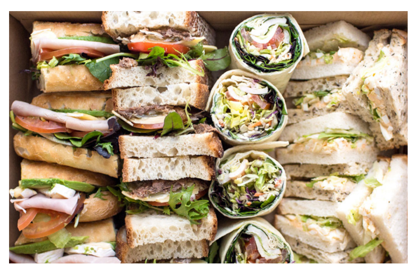
Mixed Sandwich Box