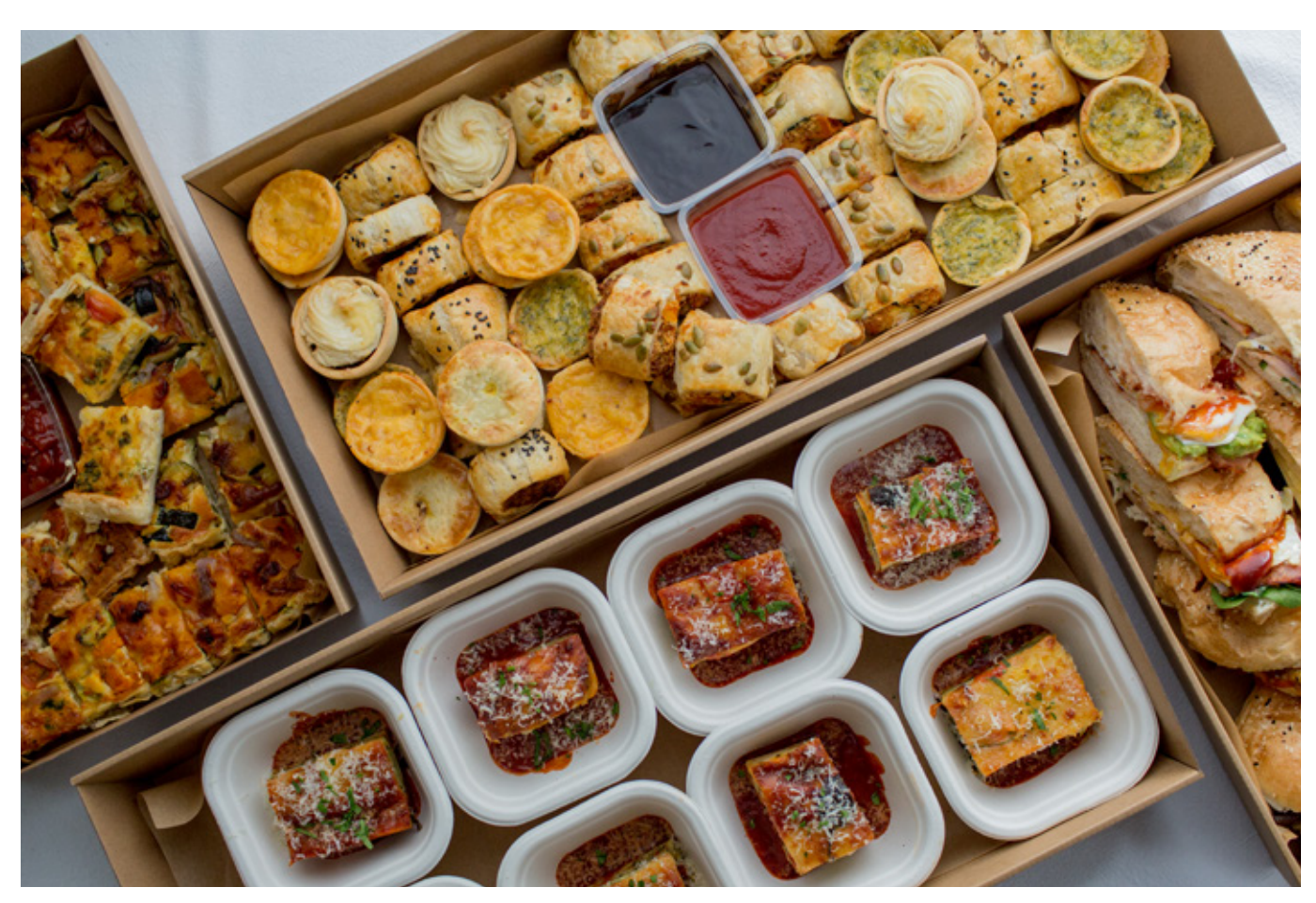
Mixed Selection of Hot Food